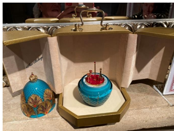
SPARKLING 20'S EGG