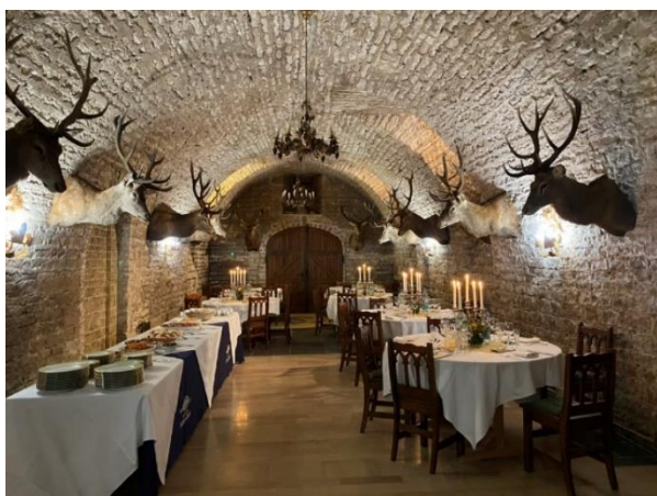
THE CELLARS OF CHÂTEAU DE BLIGNY

But a notable point of the day was visiting all the hunting dogs and the huge hunting-eagles. What handsome birds, waiting to do their master's bidding. I could go on and on but there were more surprises to come.