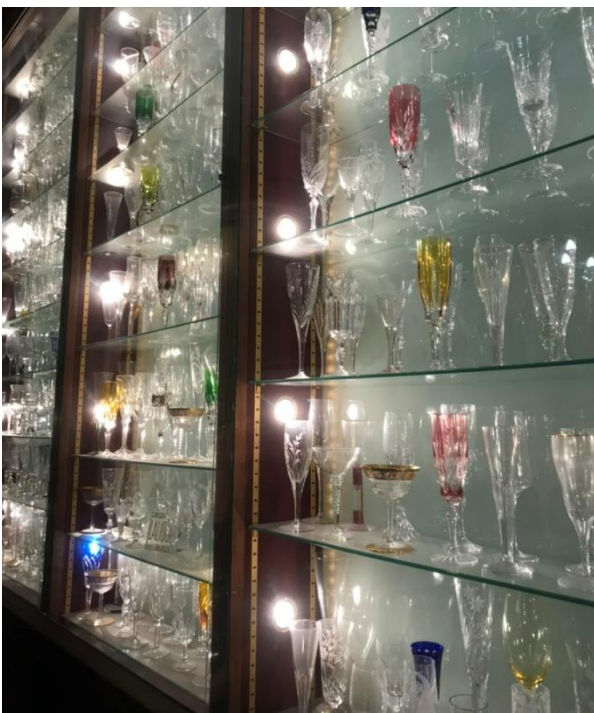
CABINET OF BEAUTIFUL CHAMPAGNE FLUTES