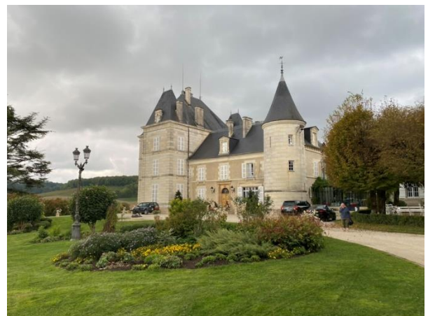
CHÂTEAU DE BLIGNY, BUILT IN 1773