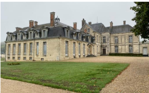
CHÂTEAU DE CIREY

I would like to have taken many photos there, but it was a private home after all, so that was not an option. However, it was a fascinating morning, wandering through the ancient halls and rooms of the 18 th century castle, and then around their gardens which were truly lovely, and photos were allowed.