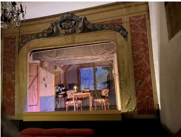
VOLTAIRE'S THEATRE ON THE TOP FLOOR OF CHÂTEAU DE CIREY. 1735