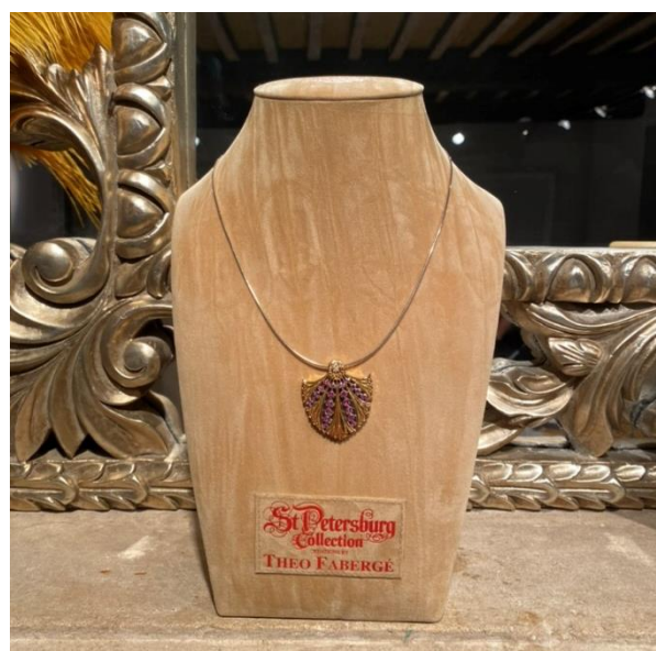
SPARKLING 20'S PENDANT BY THEO FABERGÉ

Once again, the Champagne came from the vines of Château de Bligny which surrounded the castle and could be seen for miles across the country.