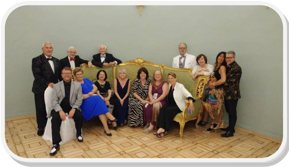
2018 Tour group awaiting a special surprise!